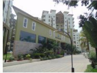
Windsor Four Seasons Phase I