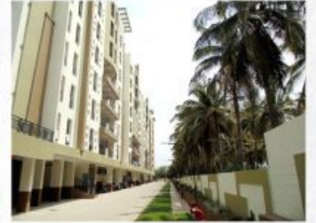
Windsor Four Seasons Phase II